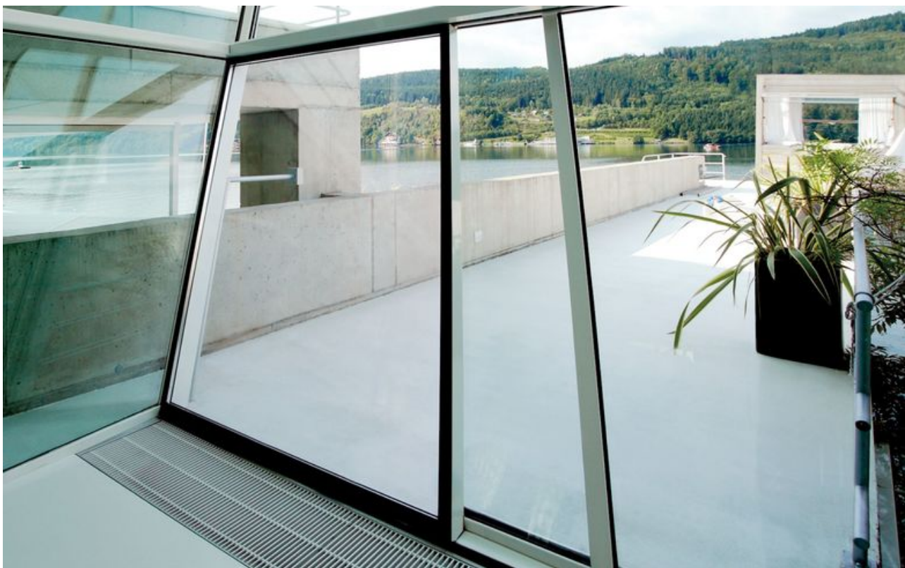
Automatic linear sliding door system for use on inclined glass façades